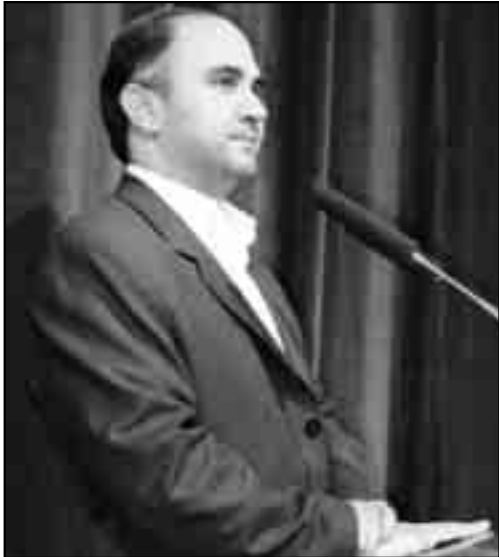
Dr. Mehdi Soleimanpour mayor of Tabriz Municipality district 2

tions of the Luminaries of Azarbaijan Complex including creation of waterscapes and pathways costing 1.5 billion rials and building the entrance metal door costing 250 million rials and making the busts and statues of the luminaries of Azarbaijan have been started concurrent with May 23 marking the liberation day of Khorramshahr.