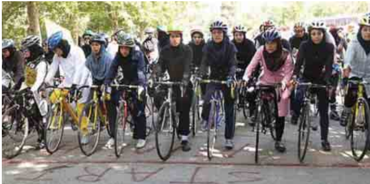
Bike for better city, women are enthusiastically riding in special lines in Tehran.

The park has 4.5 kilometers bicycle lines.