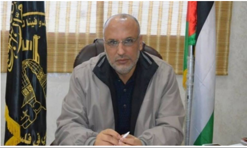
“The martyrdom of this great leader in terms of his weight, his attitudes, and his role is undoubtedly a great loss.”

The Islamic Republic, its apparatus, and its Revolutionary Guard succeeded in isolating the phenomenon of terrorism inside Iranian society as a treacherous behavior that was intended to