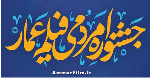
A poster for the 11th Ammar Popular Film Festival.