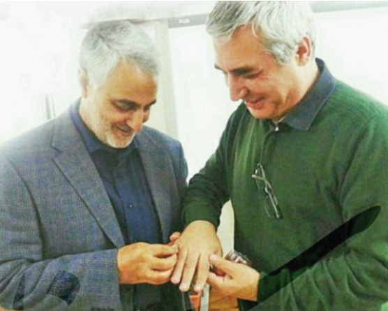
Commander Qassem Soleimani presents filmmaker Ebrahim Hatamikia with a ring during an undated meeting.

in memory of Commander Soleimani also on Kish Island. The exhibit named "Farewell to Commander" highlighted national solidarity and put a spotlight on the lofty status of the Commander. Only professional photographers participated in the exhibition where no photos taken with cellphones were displayed. The exhibit was organized in three categories, one of which was dedicated to photos representing the bravery of Martyr Soleimani. Another section focused on photos depicting people's presence at Soleimani's funeral. The other category was dedicated to photographs representing photographers' efforts to cover the funeral. The exhibit next moved to Tehran and several other cities. Later in September, the Revayat Cultural Foundation organized a photo contest on the funeral of the martyr in a virtual exhibition named "My Commander". The photo contest was held in several categories including single photo, series, cellphones and young adults.