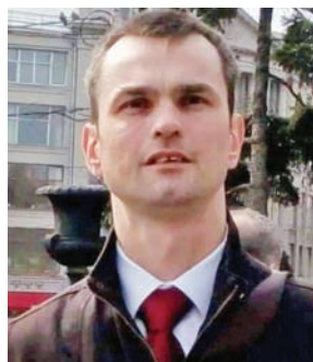
Mahdi al-Muhandis was assassinated.

To understand who General Qassem Soleimani was and what role he played in West Asia, it is important to describe some details of his biography. He was born on March 11, 1957 into an ordinary peasant family. It has been 4 years since the military coup in Iran, as a result of which the government of Mohammed Mossadegh was overthrown. It was