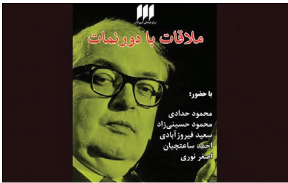
A poster Book City Institute's session "A Visit to Dürrenmatt". found out that Dürrenmatt was very strict and daring, and he was candid when narrating the truth." "One can hardly find the opportunities in life to apply