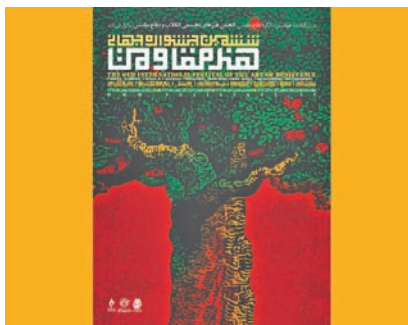
A poster for the Sixth International Art Festival of Resistance.

"Over 1000 submissions from 50 countries have been received by the organizers, and a jury is selecting the top works," he said.