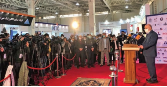
Iranian Oil Minister Bijan Namdar Zanganeh speaks in the inauguration ceremony of Iran Oil Show.

Iran Oil Show is among the most significant oil and gas events in the world in terms of the number of participants and its diversity.