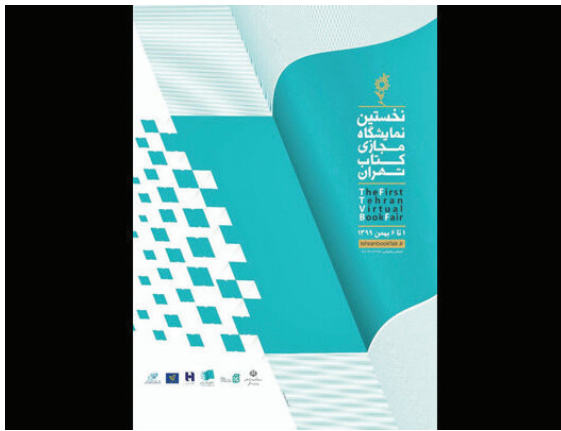
A poster for the Tehran Book Fair.

C U L T U R E TEHRAN – Dozens of publishers from Serbia and Italy are attending the Tehran International Book Fair displaying their latest offerings at Iran's most important cultural event that is organized online this year due to the pandemic.