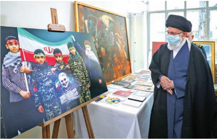
The Leader of the Islamic Revolution visits the Exhibition of Cultural Products on Martyr Soleimani

The Leader of the Revolution spoke about the progress that the Palestinians have made in confronting the Zionists as well as