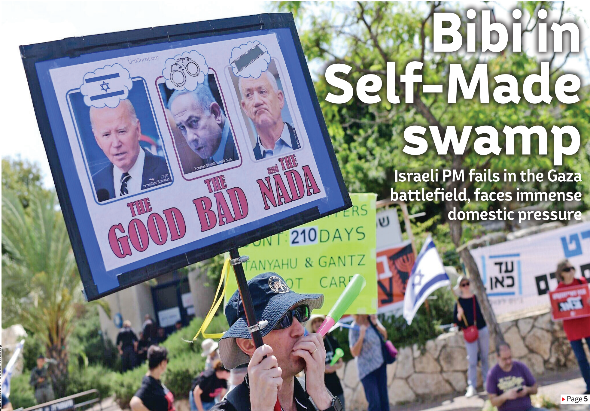
Demonstrators outside the home of War Minister Benny Gantz call on him to resign from the emergency government, in Rosh Haayin, May 3, 2024.