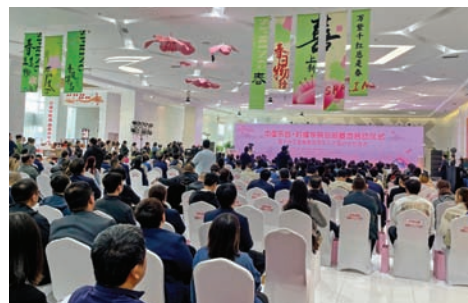
Conference on Live Streaming E-commerce in Pinggu District 'Hometown of Peaches' in China

CIPCC, under the China Public Diplomacy Association (CPDA), has initiated a program to build a platform for the media from countries around the world, especially developing countries, to observe China and