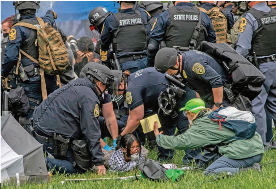
Police with riot shields detain a pro-Palestinian demonstrator as a National Lawyers Guild representative holds up an emergency contact notebook, on the grounds of the University of Virginia, in Charlottesville, Va., where tents are set up, Saturday, May 4, 2024.

"From May 13 to 15, we will host a program titled Iran's publication in the foreign sector". The event is planned to introduce Iranian publication to foreign publishers. About 20 publishers and literary agents (literary agencies) will be present at the event. During the three-day program, they will visit printing centers and bookstores. We hope that the event will be the beginning of getting to know more about Iran's publishing and books," he added. ▶ Page 8